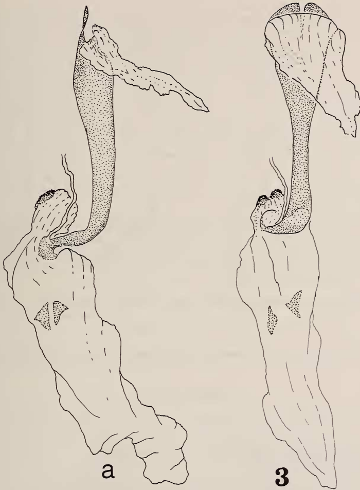
FIG. 3. Female genitalia of C. simaethis rosario Nicolay, ventral view; a, lateral view.

blue scaling confined to the base of both fore- and hindwings. Underside yellow-green as in the male, the white postdiscal line of the forewing, narrow, curved slightly basad. The postdiscal white line of the hindwing narrow, straight from the costa to below the cell where it turns slightly basad, then straight again to vein 2A, then sharply angled to the inner margin. The outer marginal grey band as in the male.